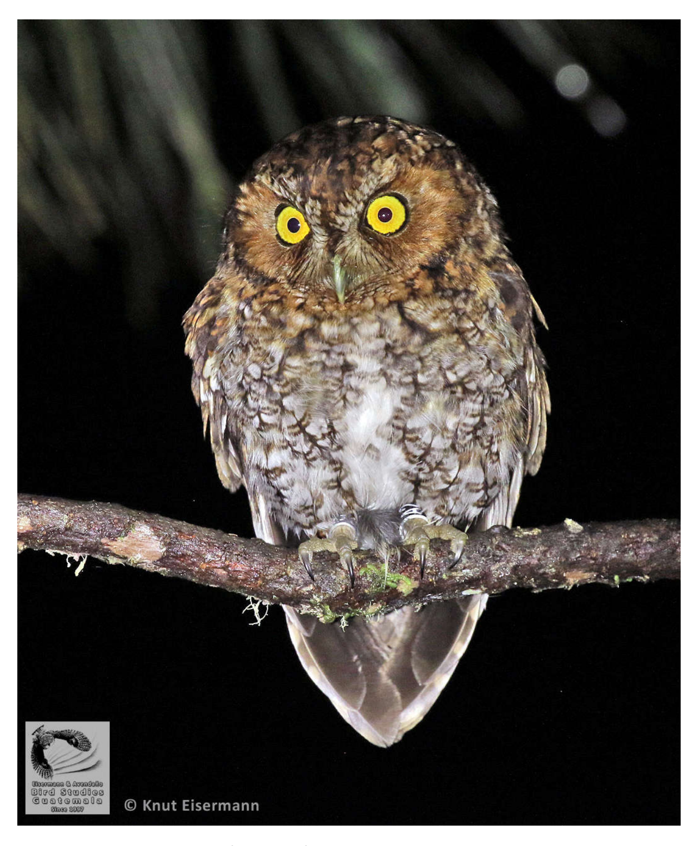
Re-sighting of a ringed rufous morph male Bearded Screech-Owl.