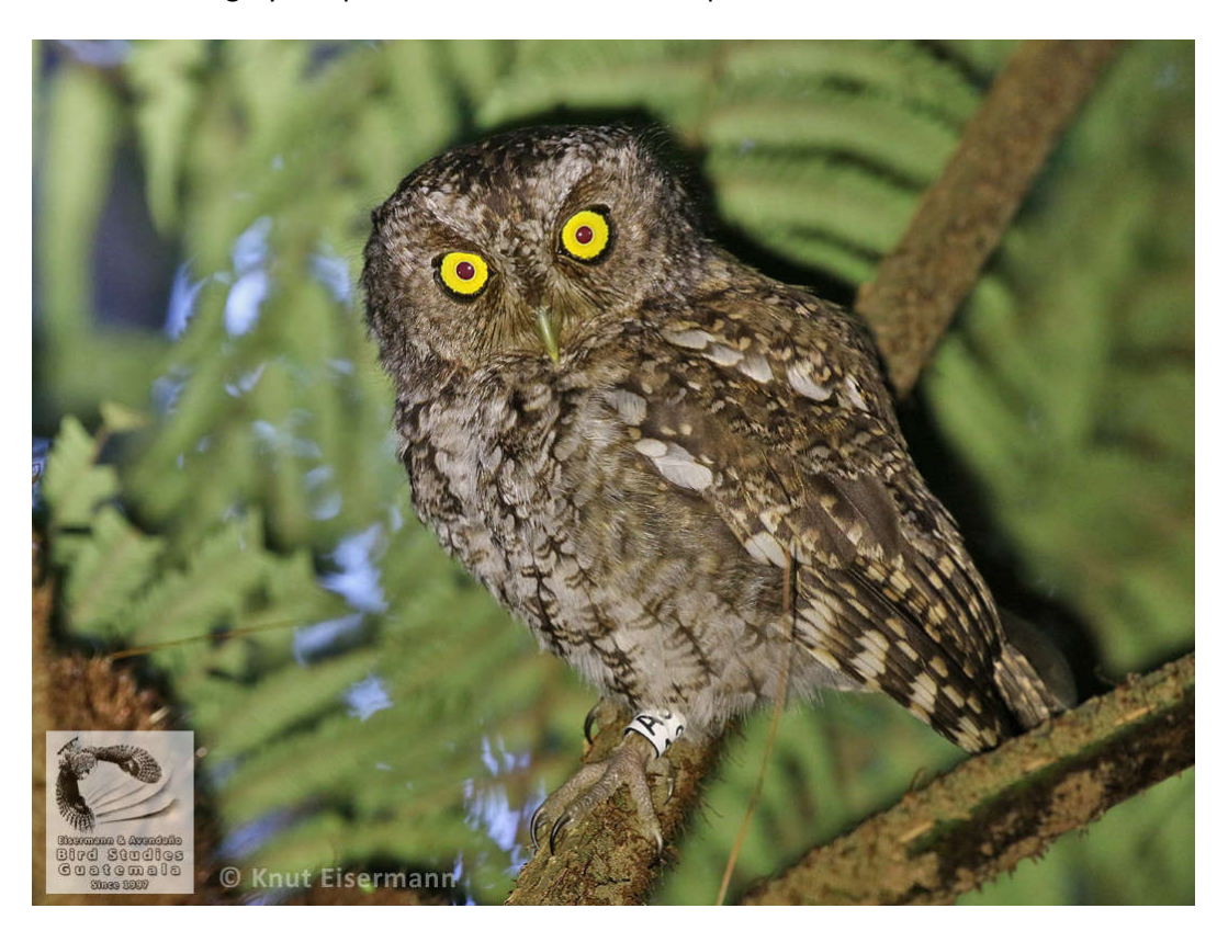
Re-sighting of a ringed brown morph male Bearded Screech-Owl.