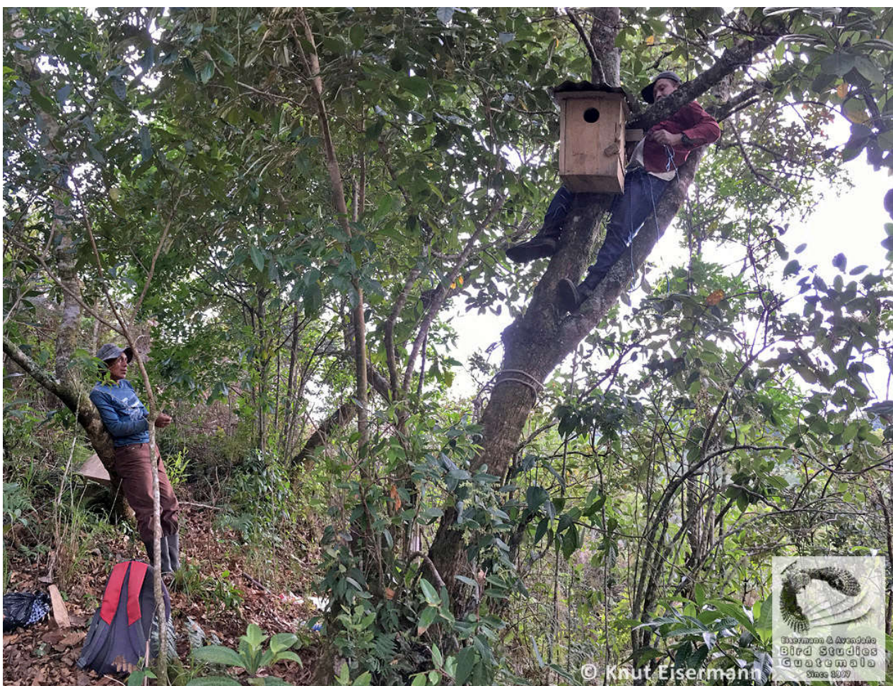
Setting up nest boxes in private lands of local farmers in the IBA Yalijux.