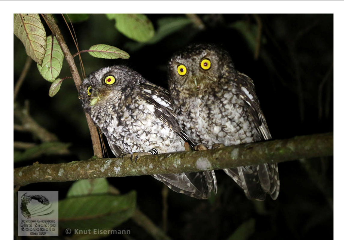
Pair of a gray morph female and a brown morph male Bearded Screech-Owl.