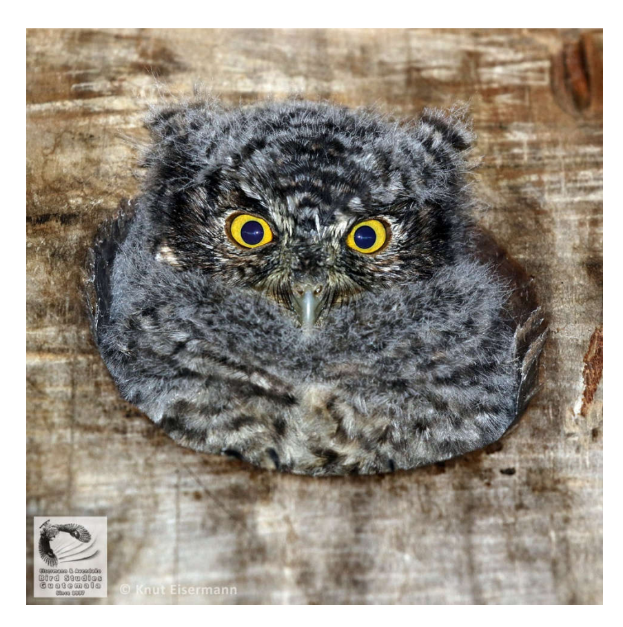
Gray morph nestling of Bearded Screech-Owl at the entrance of one of our nest boxes in the IBA Yalijux, nesting season 2022.

BIRDS ON THE BRINK'S support propelled our conservation and research initiative towards covering a larger area, providing more nest sites and enhancing the efficiency of our research effort.