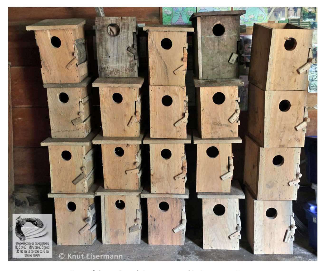
Some of the newly made boxes supported by BIRDS ON THE BRINK.